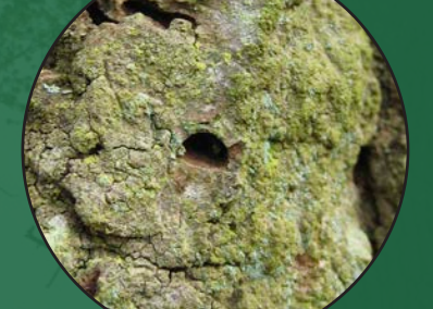
Agrilus beetle exit hole on bark