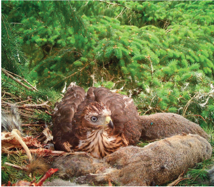
Figure 2. Goshawk chick surrounded by a glut of grey squirrel prey brought in by its parents.