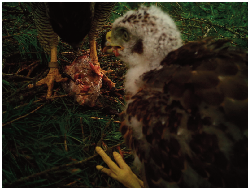
Figure 7. Adult female goshawk breeding in the Cotswolds identified from its metal ring to have been ringed as a chick in the New Forest, a juvenile dispersal of 102km.