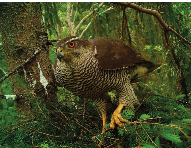
Figure 1. Adult female goshawk.

Gloucestershire is one of the UK's strongholds for goshawk with over 100 known breeding sites, contributing approximately 14% of the UK's total breeding birds. The majority of these are found in the Forest of Dean, with an increasing number of pairs scattered throughout the rest of the county. Members of GRMG have been monitoring the population for over 25 years, gathering information on the distribution of breeding pairs, timing of breeding and productivity. In 2017, in an attempt to increase the number of ringing recoveries of the project, GRMG started to colour ring chicks and use trail cameras at nests and baited winter sites to re-sight ringed birds ('re-sight' is a sighting of a ringed bird in the field). As well as providing a wealth of information on movement of ringed birds and behaviour, the nest trail cameras have given a fascinating insight into the diet of the goshawk.