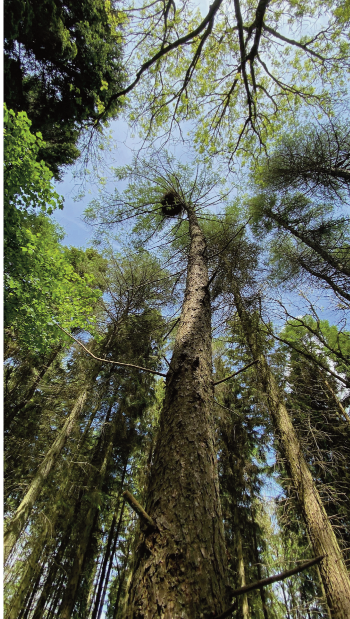
Figure 8. Typical goshawk nest, high in the whorls of a mature larch.

“Goshawk could be encouraged by ensuring that some mature conifers are retained following thinning or felling.”