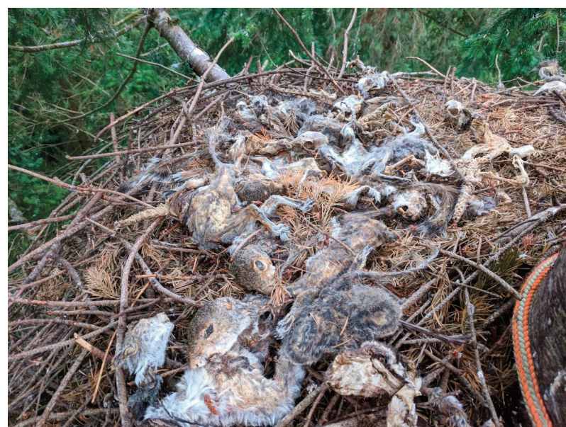
Figure 3. The remains of at least 15 grey squirrels in a goshawk nest from which chicks have recently fledged.

woodcock Scolopax rusticola , red-legged partridge Alectoris rufa , pheasant Phasianus colchicus , lesser-spotted woodpecker Dryobates minor , great-spotted woodpecker