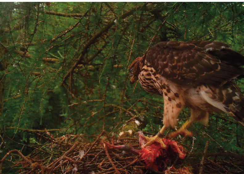
Figure 4. Goshawk eating a woodpigeon, another frequent prey item.

Dendrocopos major , blackbird Turdus merula , mistle thrush, song thrush, rabbit and brown rat Rattus norvegicus . Small birds are only taken in small numbers, probably opportunistically rather than targeted, and we often note that passerines such as firecrest Regulus ignicapilla and spotted flycatcher Muscicapa striata nest close to goshawk nests at a much higher frequency than could be expected by chance – perhaps because the resident goshawk pair provide protection against nest predators such as corvids and grey squirrel. It is apparent that adult goshawk rarely take gamebirds in the breeding season (1.2% as per Barron, 2022) but we acknowledge from numerous conversations with landowners and gamekeepers that fledgling juvenile goshawk can target newly released gamebird poults in July and August – although it is considered that the estimated losses of gamebirds to raptors are generally relatively low, between 1-8% (Park et al., 2008), with some exceptions (Kenward, 1977).