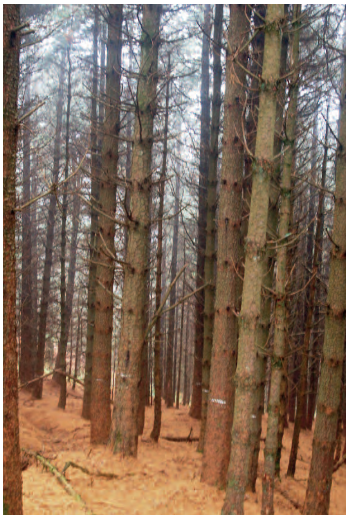
Figure 6. Pinus peuce at 55-years old in the Kilmun arboretum, Cowal, Argyll.

The American Pinus palustris (longleaf pine), like P. peuce goes through a similar period of slow initial growth called the 'grass stage', which is believed to be under strong genetic control. Although the length of time that individual seedlings remain in this stage is influenced by the environment, it can last for as long as 25 years and often for 15 years. Reasonable stands will reach breast height at about eight years. Generally seedlings of P. palustris remain in the grass stage until they reach 2.5cm at the root collar, and they invariably begin more rapid height growth upon reaching that size. The control of vegetation competition is a major factor in stimulating fast diameter growth; if it is good, height growth can begin at the end of the second year (Walker and Wiant, 1973). It is possible that a similar mechanism may operate in P. peuce . It does not exist in Pinus strobus .