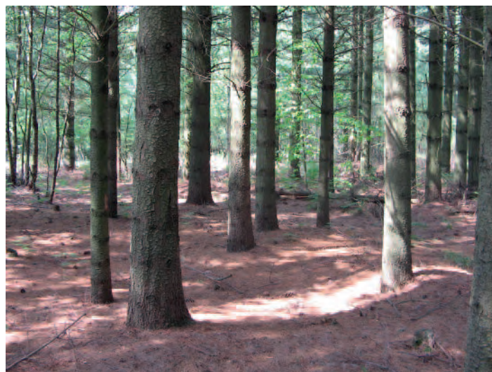
Figure 3. A Pinus peuce stand at the Forestry Commission’s Bedgebury pinetum in Kent.

Limited experience exists with the tree in Britain, but such as it is, together with an account of the tree’s performance in its natural habitat, has been given by Lines (1985a). It appears likely to grow well on a wide range of soils, including peats, in such inhospitable places as the central and northern Highlands of Scotland (Fig. 4). In its native range, it grows on soils derived from acid parent materials, but also on serpentine. The soils are usually poor in nutrients. The tree does best where the climate is humid, especially in summer, and it can withstand much snow in winter. It is adapted to cold mountain climates with long winters and short summers. In its native range, the most extensive and best stands are found on north and northwest-facing slopes (Holzer, 1972) as with Caledonian pine in Scotland. It withstands exposure and atmospheric pollution well, and the cold mountain climate and high air humidity provide very suitable conditions according to EUFORGEN (2015), who also say that: “the exceptional adaptation of Macedonian pine to the severe mountain climate conditions makes it a valuable species for afforestation on high terrain for protection against erosion”. Farjon (2015) states that it is usually found on north-facing slopes on siliceous soils and rarely on carbonate soils. Holzer (1972) considered that: “For best growth both P. cembra and P. peuce prefer light and humus soils; heavy