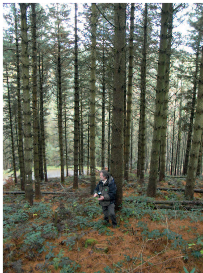
Figure 7. Pinus peuce in the Brechfa Forest Plots at age about 50 years.

Unlike Weymouth pine ( Pinus strobus ), another five-needled pine, Macedonian pine is resistant to attacks from the blister rust, Cronartium ribicola . This was noted by Stirling-Maxwell in 1929 at Corrae and also by Wilson (personal communication) at Crarae, where P. wallichiana was also affected. It is also resistant to attacks from the pine beauty moth caterpillar, Panolis flammea ; is less susceptible, though not immune, to red band needle blight, Dothistroma septosporum , that is affecting all other pines grown in Britain; and little affected by the pine wood nematode, Bursaphelenchus xylophilus , another potential threat to many pines, including Pinus pinaster (Savill, 2015). In fact, it seems likely to be a remarkably hardy and healthy tree in Britain. Various bark beetles in the genera Ips , Pityogenes ,