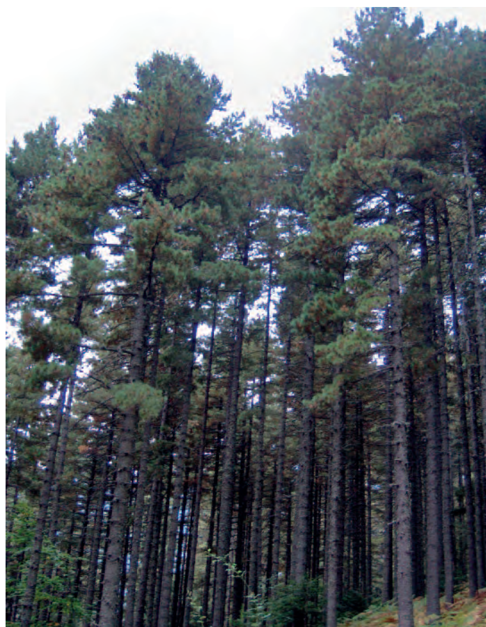
Figure 1. Natural pure stand of Pinus peuce in the Mount Pelister National Park in Macedonia. The trees show the same high stocking density that is found in Britain and therefore presumably also have a high basal area.

needled pines (Forest Research, 2015). The name 'peuce' is not a reference to a reddish or purple colour (e.g. of the developing cones), but is derived from the Greek peuke meaning 'pine tree'. Indeed, some older texts refer to the species as Pinus peuke .