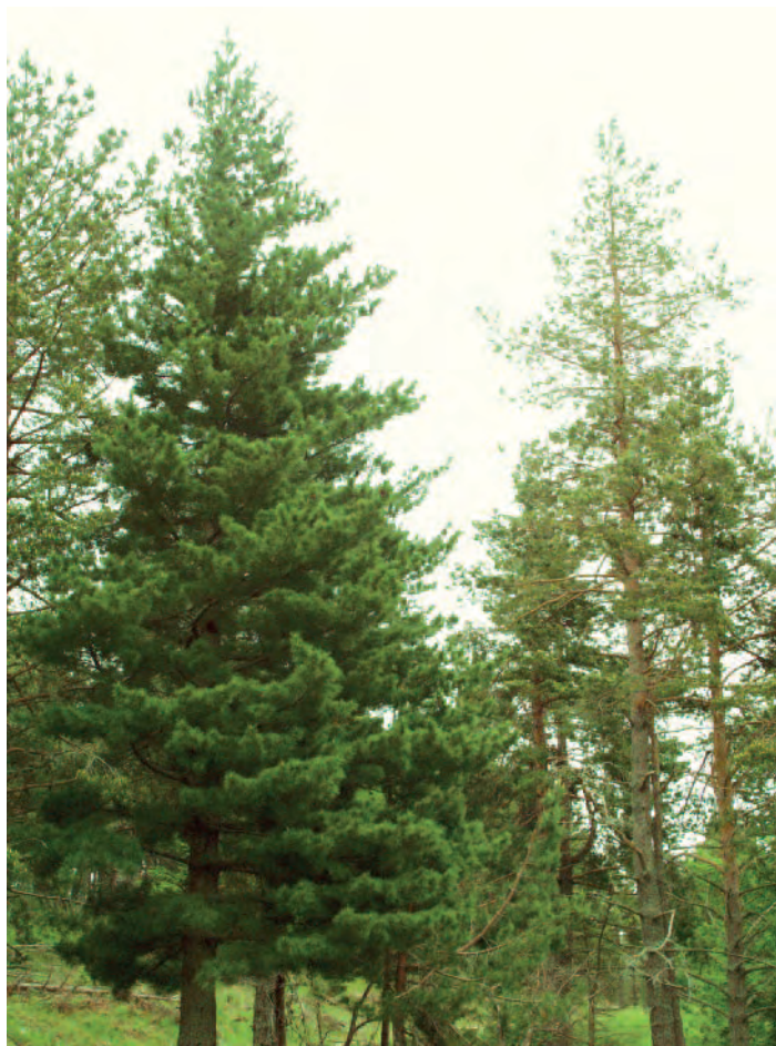
Figure 2. Pinus peuce growing alongside Scots pine in the Voras Mountains of northern Greece at the southern edge of the natural range.