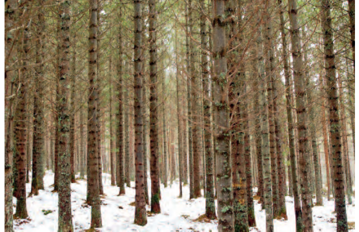
Figure 5. Pinus peuce in a trial at Culbokie, Black Isle, Ross and Cromarty. Self-pruning is said by some to be good, but experience in Britain suggests that this is not the case.

Pinus peuce is potentially a big tree (see Fig. 4), growing up to 35 to 40m tall, although it is very much shorter near tree lines (Alexandrov and Andonovski, 2011). In the Balkan Mountains it reaches 26m at the age of 160 years. The tallest specimen in Britain was recorded by Johnson (2003) as being at Chatsworth House, Derbyshire, at 41m tall and 92cm diameter. It grows very slowly when young, and has intermediate shade tolerance, but is capable of sustained growth over many years (Forestry Commission, 2015). Keenleyside (1985) found that the tree grew initially at 10-12cm a year at Corrour in the Highlands, though later it produced leader extensions of 20-30cm, possibly as a result of the heather having been suppressed. It eventually grew at