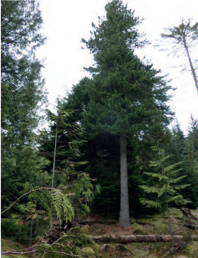
Figure 4. An exceptionally large Pinus peuce 31.8m tall and 64cm dbh, at Corrour in the Highlands.

grassy soils very often make growth impossible". In Britain it will grow on a wider range of soils, from flushed peats to podzols and sand dunes i.e. poor to medium nutrient regimes. It is hardy to between -23.3^{\circ}\text{C} and -28.8^{\circ}\text{C} and not known to be particularly drought sensitive.