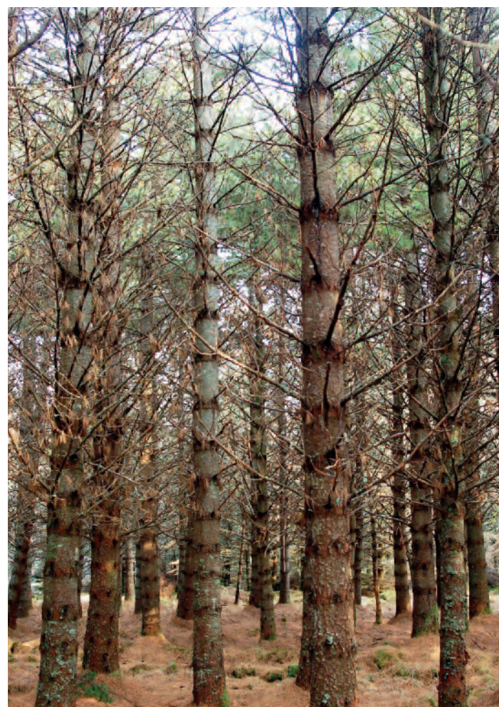
Figure 8. Pinus peuce at Shin, Sutherland at age about 40 years. Note the coarse branching and apparently high basal area in comparison with natural stands shown in Figs. 1 and 2.

This slow initial growth is carried over into the early years of the establishment phase as shown by results from a 1995 experiment near Llandovery in mid-Wales. This investigated the effect of fertilizer or herbicide inputs on survival and growth of Macedonian pine planted on either a cultivated (scarified) site or uncultivated ground. Scots pine was also planted for comparison. After six years, the main result observed was an increase in survival of Macedonian pine in the presence of cultivation (Table 1), but height growth was slow and less than half that found with Scots pine.