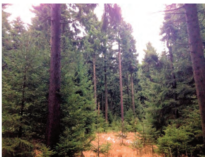
Forest Development Type 122. An uneven aged, complex structured Norway spruce stand, Germany. Other similar FDTs might combine timber bearing conifers, such as Sitka spruce with western hemlock, or accept an admixture of broadleaves in the understorey (such as birch or rowan).

The practicalities of 'climate adapted' woodland creation have yet to be established in practice. They will need to be designed to guide the creation of forest 'natural capital assets' that provide both ecosystem services for the benefit of society and private goods for the benefit of landowners. They are very likely to include species currently unfamiliar to