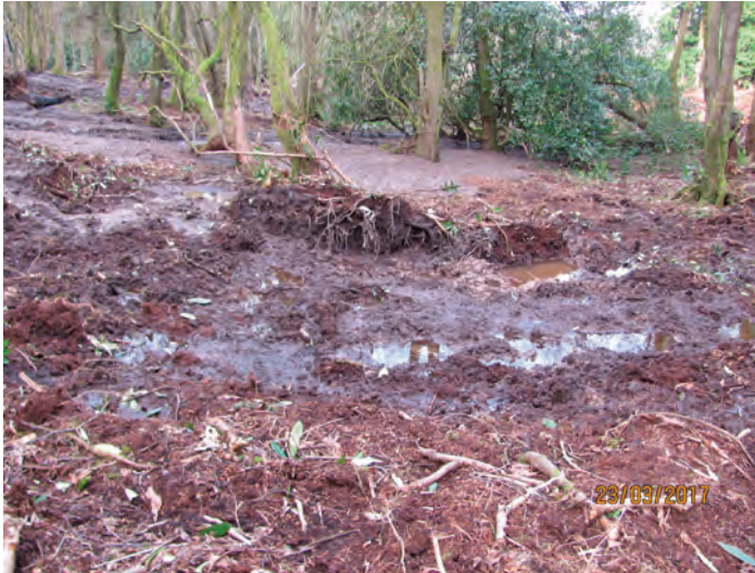
Soil surface damage following rhododendron clearance in wet weather, Bury and Redlands Forest, Surrey, February 2017. Conservation operations also impose damage to forest soils when undertaken in wet weather. The free draining soils here are on sandy gravels and consequently should recover fairly quickly.