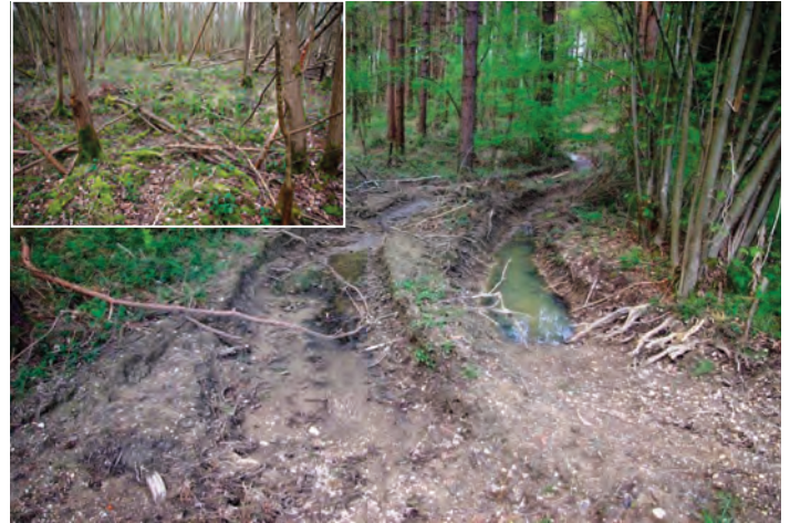
Soil damage to forest soils following forest operations on heavy Wealden clay soils, Chiddingfold Forest, West Sussex, winter 2013/14. The compaction and rutting on such clays takes many decades to recover, if at all. The inset shows shallow thickets that arose from similar operations on compacted Wealden clays in 1987. Planted oaks and other species failed and the soils have still yet to recover from the compaction.

locked into the descriptions found within woodland type classifications such as the Peterken Stand Type classification (Peterken, 1981), or the National Vegetation Classification (Rodwell et al., 1991) may also require re-examination.