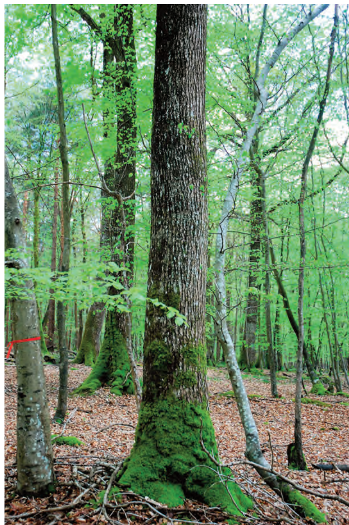
Forest Development Type 512. An uneven aged, simple-structured mixture of pedunculate oak (as the primary species) with an understorey of beech (as a secondary species). Other similar FDTs might combine oak with birch, lime, hornbeam and minor species such as rowan or cherry depending on location and soils. New Forest.